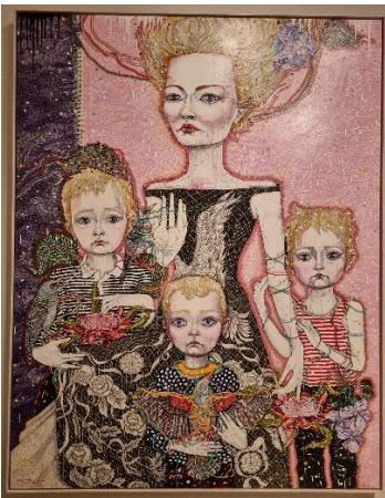
Mother (a portrait of Cate) Del Kathryn Barton, 2011 1995

On a wet Mothers' Day Sunday in Cairns, I treated myself to a visit to the Cairns Art Gallery. I didn't know what to expect, so was delighted to find that their featured exhibition was Archie 100; A Century of The Archibald Prize . 2021 marks the one-hundred-year anniversary of Australia's oldest and most-loved portrait award, The Archibald Prize . It is unequivocally the most coveted art award for contemporary Australian portrait artists. The exhibition brings together almost one hundred artworks selected from every decade of The Archibald Prize exhibition. It is the result of many years of research and searching for lost portraits. Archie 100 includes portraits from the Art Gallery of NSW's Collection as well as works from libraries, galleries and museums across Australia and New Zealand, and from private Australian and international collections, a number of which have never been seen since being exhibited in The Archibald Prize . Archie 100 will be showing at the Art Gallery of South Australia from July through to October and will be our featured AGSA tour in August. Here is a selection of my favourites.